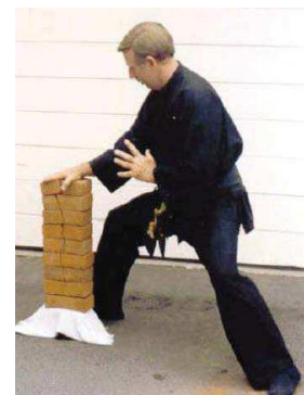
Slapping Bricks 8 out of 9

Among many of my kung fu colleagues and students, I have noticed that too many people are worried about quickly achieving such titles as "Master" or "Grand Master" etc. It is not the title that will make you good, but the right teacher, dedication, and the many hours and years that you really train. And I stress really train. You must always be honest with not only to your teachers, but with all people and, above all, with yourself. Only then will you gain genuine respect.